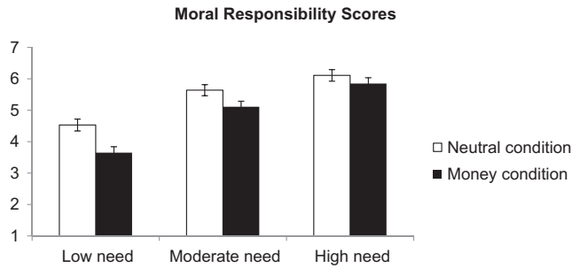
Figure 2. Mean moral responsibility to help as a function of level of need and condition (Experiment 2). Error bars represent standard error of the mean.